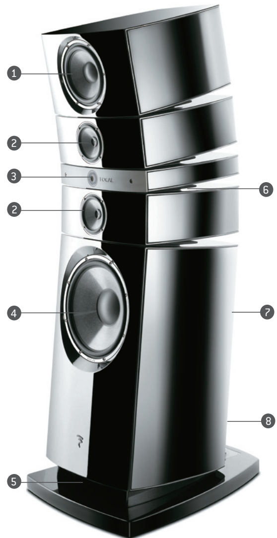
Removable tweeter and woofer grilles